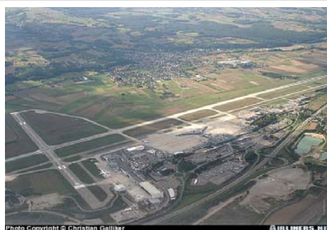
www.euroairport.com

KARLSRUHE -Baden RWY03/21: 2,980x45m Weather Cat I RWY21 Open 06.00-23.00 hrs. Terminal Areas: Passengers 11,000m2 Cargo Apron 10,000m2 Handling by Airport Limited Maintenance Main Characteristics former US airforce base Business Park available €114 mn. investment Key figure 2005 0.7 million passengers