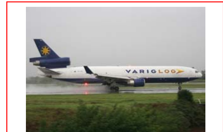
VarigLog MD11F / 25.9.06